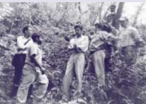
Starting the initial work for drinking water construction. A reservoir will be constructed in this intake point.

this project various training courses and adult literacy classes were organised.